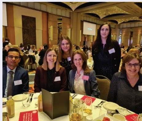
▲ ANZPAA Staff at the International Women's Day Breakfast

This year's International Women's Day theme was Choose to Challenge as A challenged world is an alert world and from challenge comes change . The ANZPAA NIFS team reflected on how we individually and on behalf of ANZFEC were embodying this theme through the Engender Change program (see next section of this newsletter). The day sparked some great conversations about our experiences, actions, and potential activities we could initiate to further develop the program and expedite change in the forensic community. We encourage you to reflect on how you might choose to help forge a gender equal workplace.