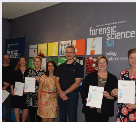
▲ Forensic Science SA Managers and Team Leaders with their Certificates

ANZFEC and ANZPAA NIFS have some exciting activities in development for Engender Change advocates over the coming 24 months. If you want to join the program, contribute to meaningful change and have the chance to be part of these opportunities, contact ANZPAA NIFS ( secretariat.nifs@anzpaa.org.au ) to see how you can get involved.